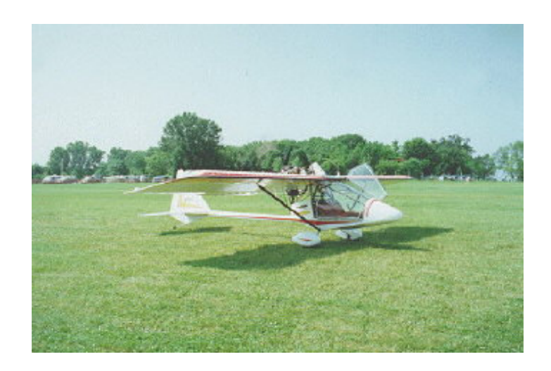
Photo 13: Kolb Mark III The New Kolb Aircraft Mark III experimental aircraft.

In 1990, after the FAA allowed for heavier 2-place ultralights, the same basic TwinStar Mark II design was strengthened (main spars increased from 5" to 6" diameter) to carry the more powerful Rotax 582 engine and also to increase the gross weight to 1000 lb. resulting in the TwinStar Mark III. In 1993, the Mark III lite was introduced. The lite version was discontinued in 1994 as most people wanted the flaps which the Lite version did not have. Cabin width is 42 inches and entrance is through one of the two gull wing style doors.