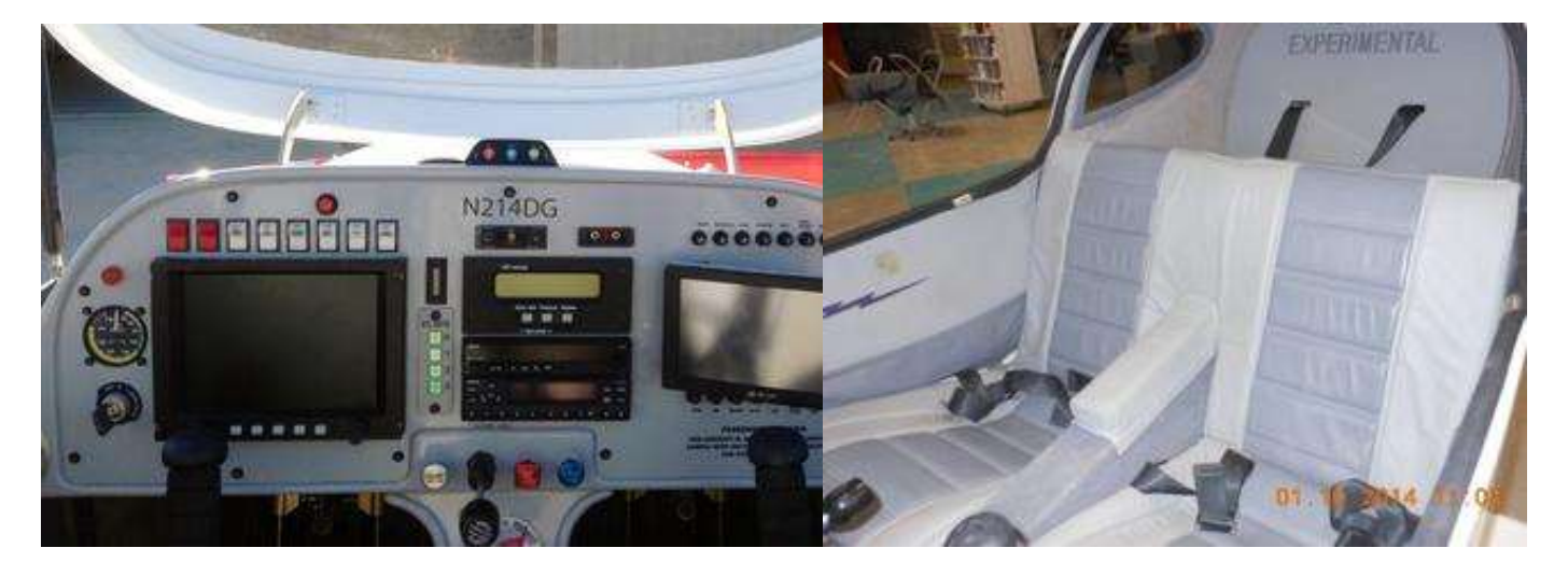
Contact Lightning West for details and more information. They also have a Jabiru aircraft for sale.