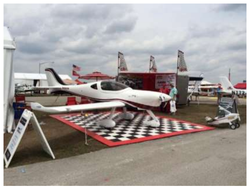
N320XS in the Booth

It seemed that Sun-N-Fun was a bit busier than last year. I believe it was and the Sun-N-Fun organizers said it there were more people and vendors, so it may very well have been. We had a lot of folks stop by to look at the XS and ask a lot of questions. There seemed to be several people that were serious, but you really can't count them until they sign the check.