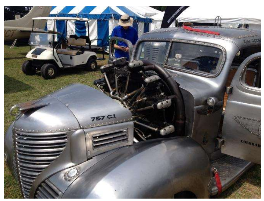
You Never Know What You Might Find at Sun-N-Fun

I am still looking for Pilot Spotlight and Lightning of the Quarter candidates. Please consider taking a little time to answer one or both of the questionnaires and sending me the data with some good pictures.