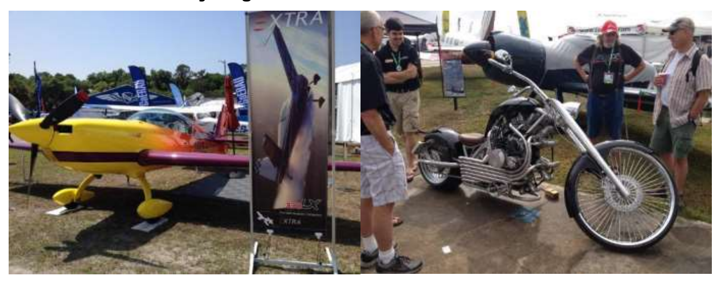
An Extra 330LX