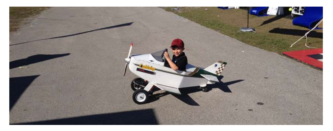
The Coveted Tail Dragger Lightning (Not For Sale)