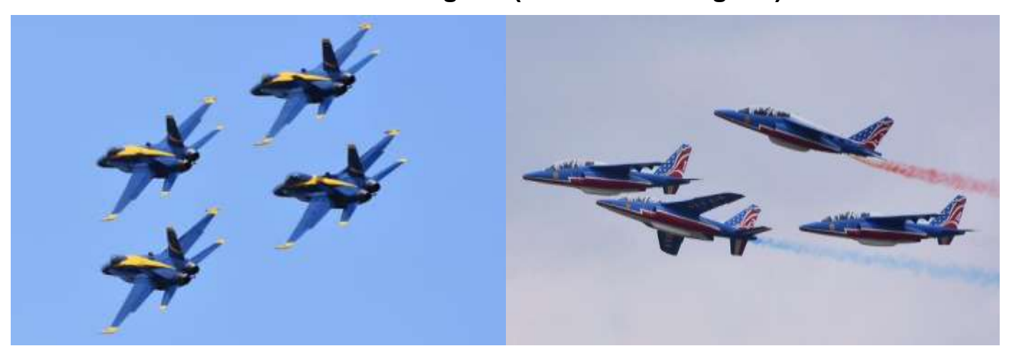
The Blue Angels and the Patrouille de France Demonstration Team