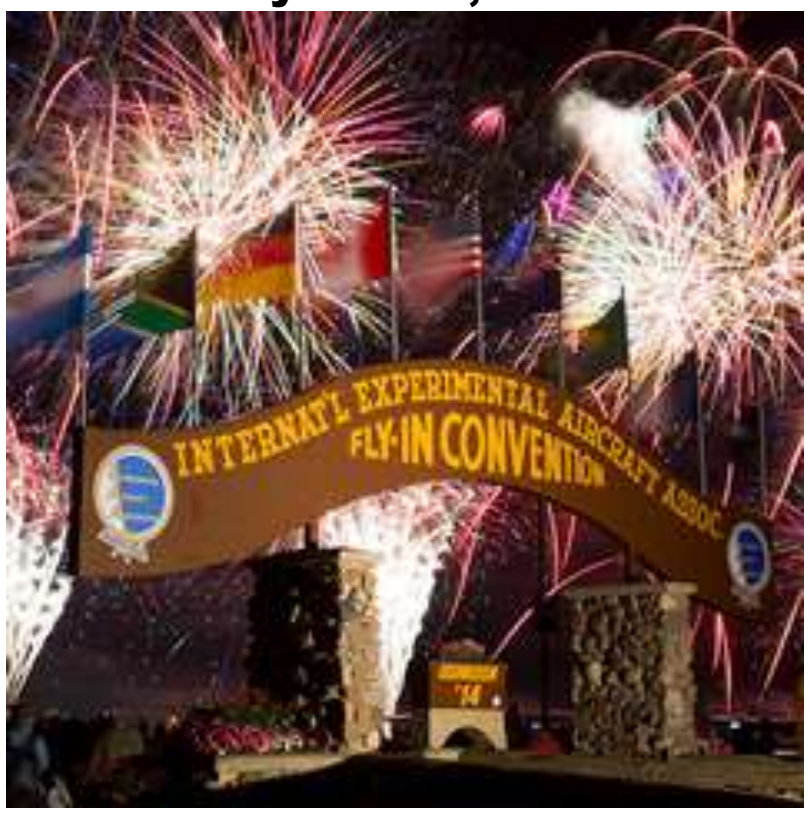
EAA AirVenture 2017 Airport Identifier – KOSH