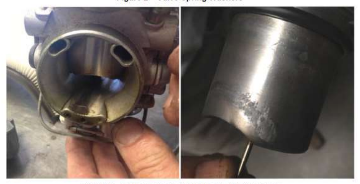
Figure 3 - Carburettor Contamination & Slide Wear