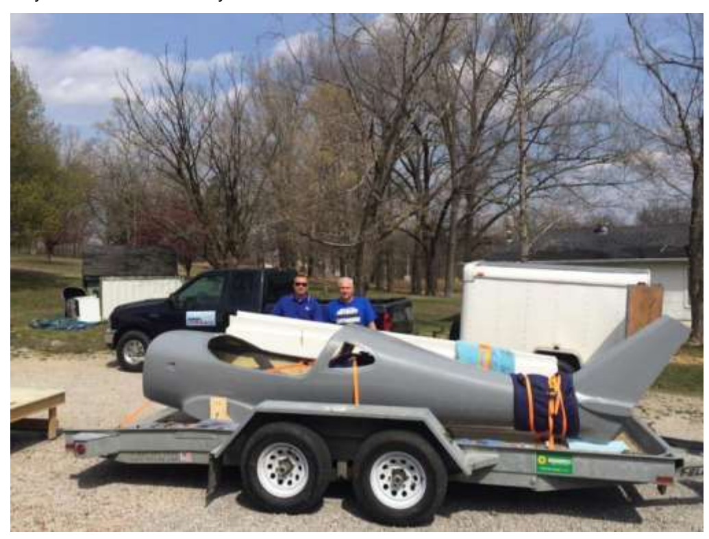
A New Kit Headed Home with a Builder

I would really like to hear from other dealers as there are sales and or aircraft for sale. The Matronics Lightning List has been very quiet and although I am on the list for getting the e-mails for any posts, I only get them once in a while. I think their software is having problems, but they have not found the issue yet. In any case, my e-mail is on the first page of the magazine and you can contact me any time with information.