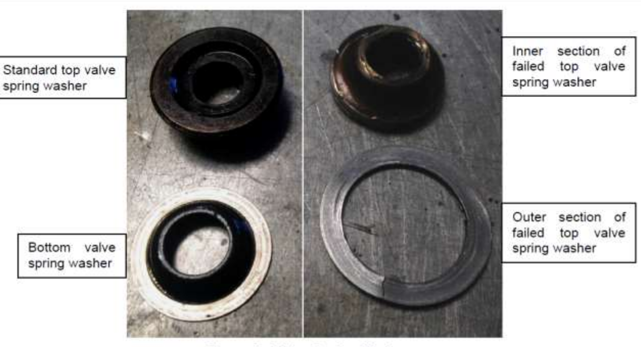
Figure 2 - Valve Spring Washers