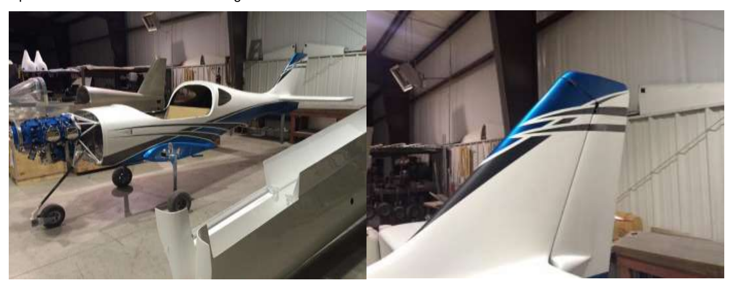
New Paint Scheme for the Demonstrator Lightning XS

The new demonstrator airplane is nearly finished. The pictures below show the plane in its pretty new livery and the new streamlined cowl getting fitted on the current demo airplane, N320XS. I can't wait for the reports on the new plane and the performance that should be amazing.