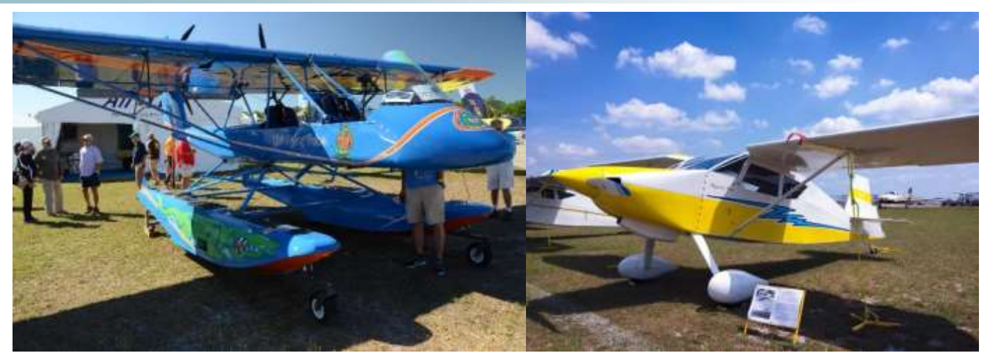
An AirCam in Gator Colors