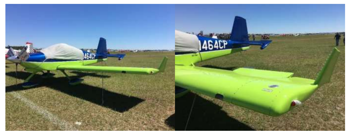
An RV-9 with Winglets (VGs on the Winglets)

I had to take a picture of the AirCam, I am a University of Florida graduate after all. The Wittman Tailwind looks fast just sitting there, it is such a timeless design. A couple more pictures below, hope to see you there next year.