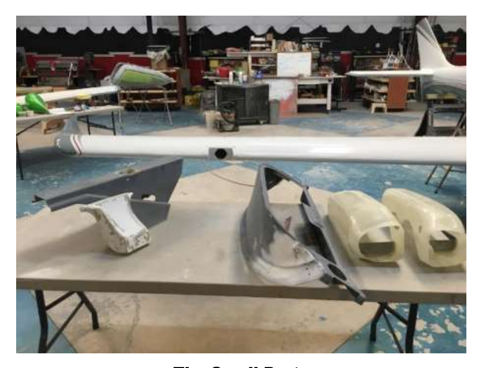
The Small Parts