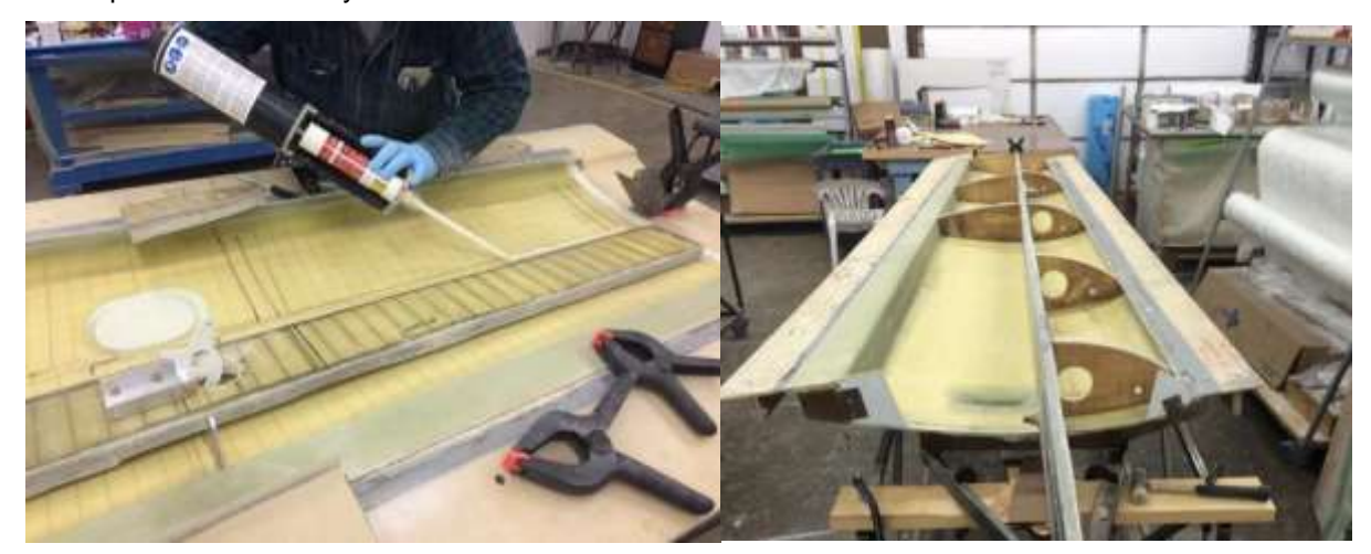
Attaching the Spar

More pictures of the wing layup and finish below. I think Jason really does have it and could easily complete all the wings and other parts as necessary.