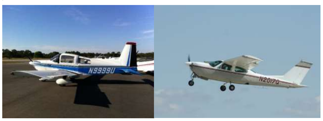
The Plane I Learned to Fly In