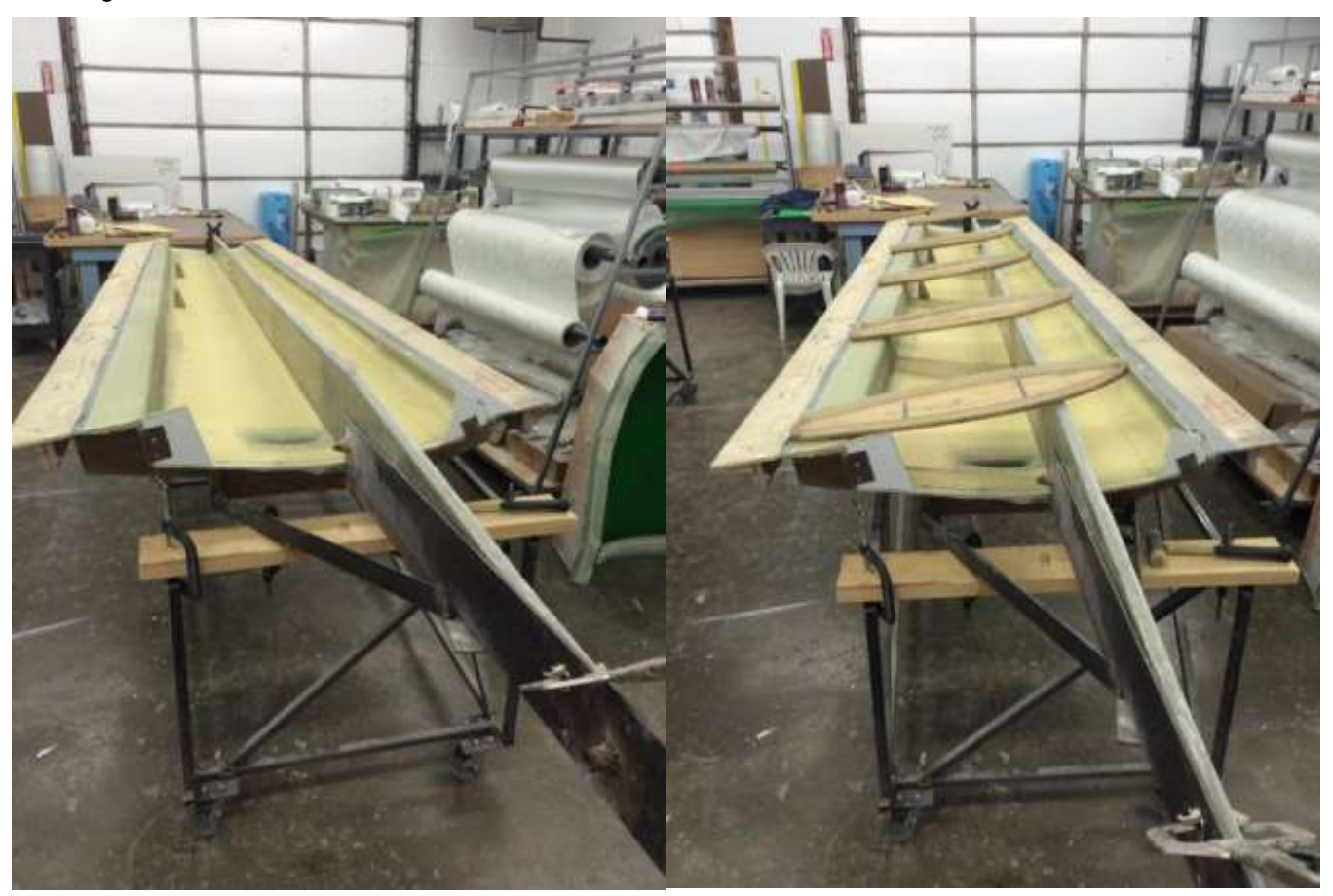
The Wing Layup

There is still some work to go getting the air intake, etc. But the cowl is much more aerodynamic looking compared to the cowl for the O-320 engine. Below are some pictures of a visit to the fiberglass supplier, AM Composites. Jason got to complete some wings for a new kit. It is possible more of this type of finishing will happen at the Shelbyville facility. Jason says, "He's got it."