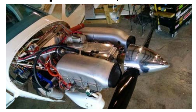
Airport Identifier - KSYI Shelbyville, Tennessee