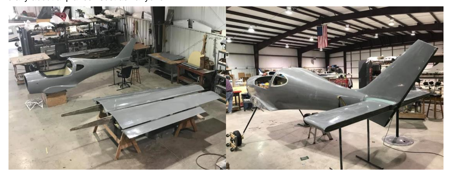
The New XS is Moving Along Nicely

Above is one of the pictures from the Homecoming. I really like these evening shots with the Hangar full of airplanes. The flag is hung properly and I think it is really pretty. But then, I'm an airplane nut. Certifiable crazy about airplanes. Just ask anyone.