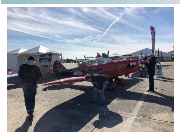
A Warner Sportster for Sale