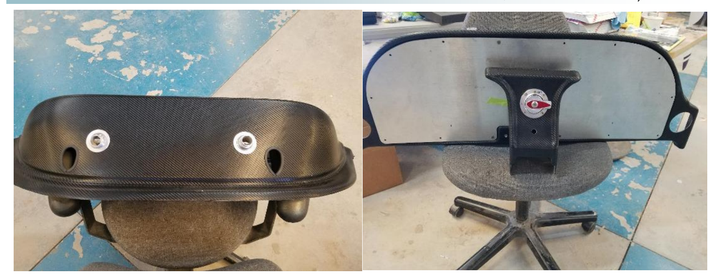
Carbon Fiber Instrument Panel Mount and Fuel Console