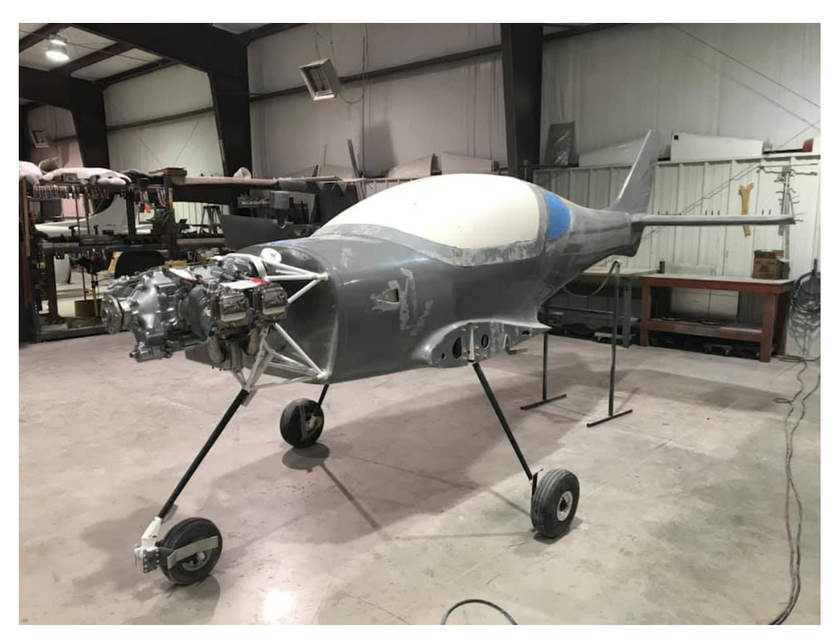
That XS You Saw in the Pictures Before, Well Here She is Again

Russia and CIS, AVIA-NIANIA Ltd. Moscow, Russia, Phone: + 7495518-62-75, Mobile Phone: + 7925518-62-75, avianiania@mail.ru or avianiania@aol.com