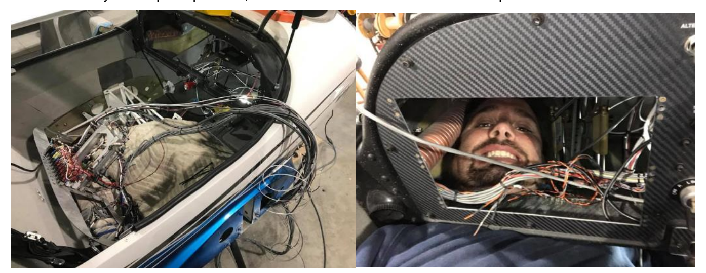
Wiring Up the New XS Demonstrator

Never saw any of the paint pictures, but I am sure this Jabiru aircraft is all painted nice.