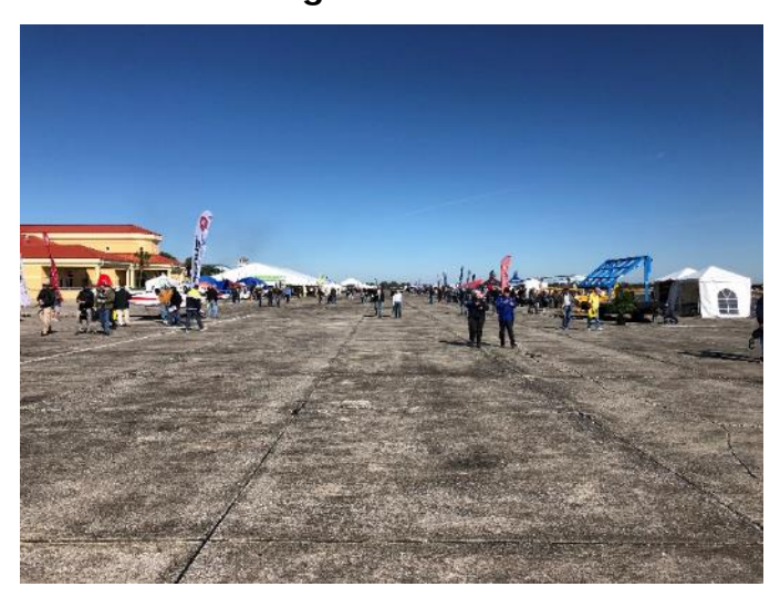
A Picture Looking Down the Line - It was busier after lunch.