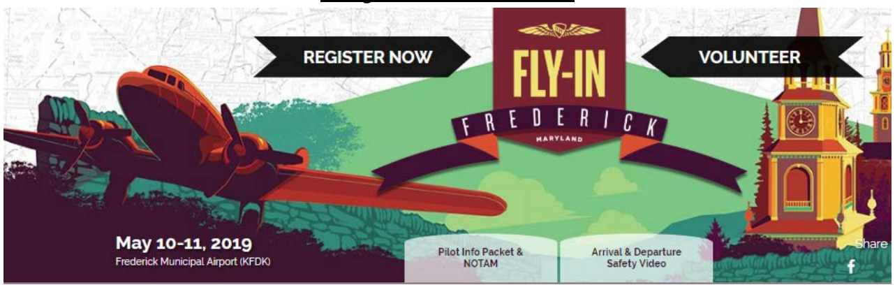
Fly In to Frederic