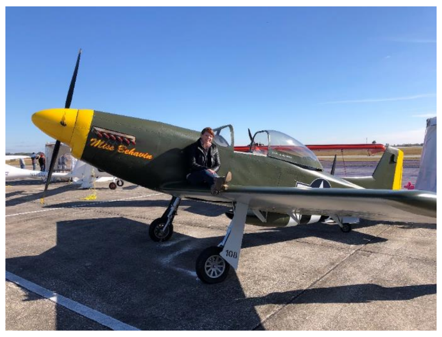
A T-51 with a Young Lady on the Wing

The show at Sebring is always interesting. This year was the 15<sup>th</sup> anniversary of the first show. I did not take pictures of the entire show, just pieces that are interesting to me. There were the normal fly byes and demonstration flights for most of the manufacturers. Tecnam has their hangar right there on the show center and I did not take a picture of their fleet. They were well represented. Cruiser Aircraft operating out of Sebastian Municipal airport was there. They had two airplanes and two young ladies from Czechoslovakia there to help show off the planes. They also had a few guys there to give a ride or two and actually sell the planes. The young ladies were there last year as well.