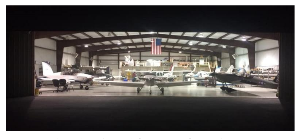
Arion Aircraft at Night - Love These Pictures

Blue Skies, Dennis W. Wilt dwwilt@aol.com