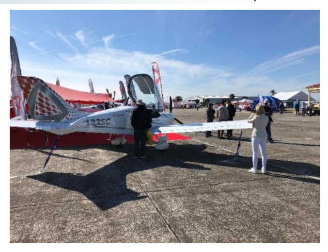
One of the Sportcruisers