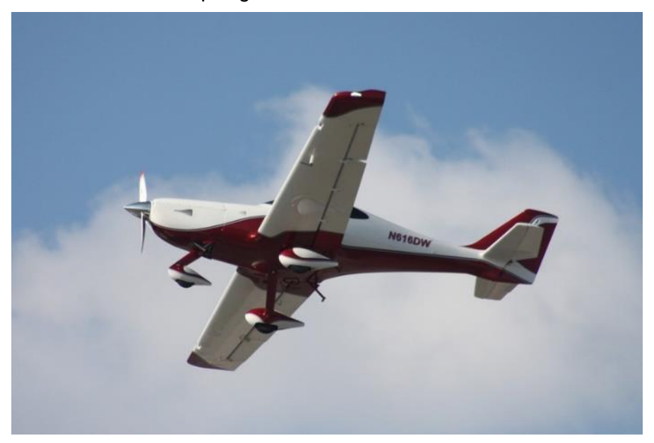
Taking off at Sun 'n Fun Several Years Ago

Please send me some updates on projects and maybe some pictures of your airplane. I really would like to add a Lightning of the Quarter or a Pilot Spotlight.