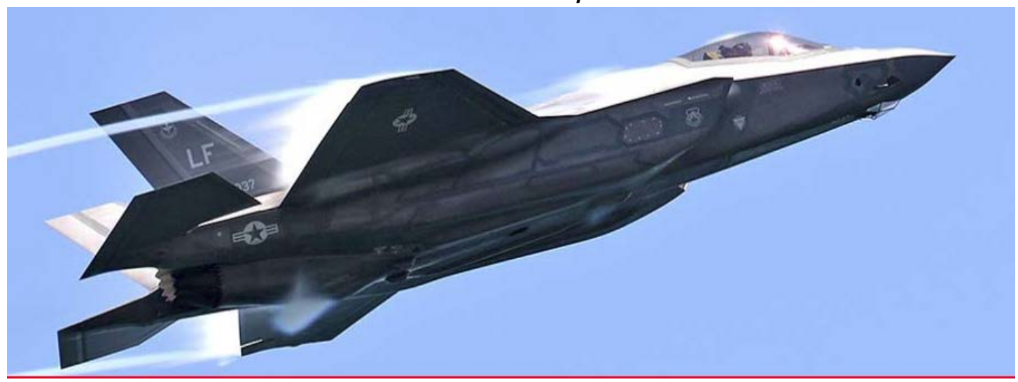
Melbourne Air and Space Show Airport Identifier (KMLB)

Sun - N- Fun Fly-In-Lakeland, FL April 02-07, 2019