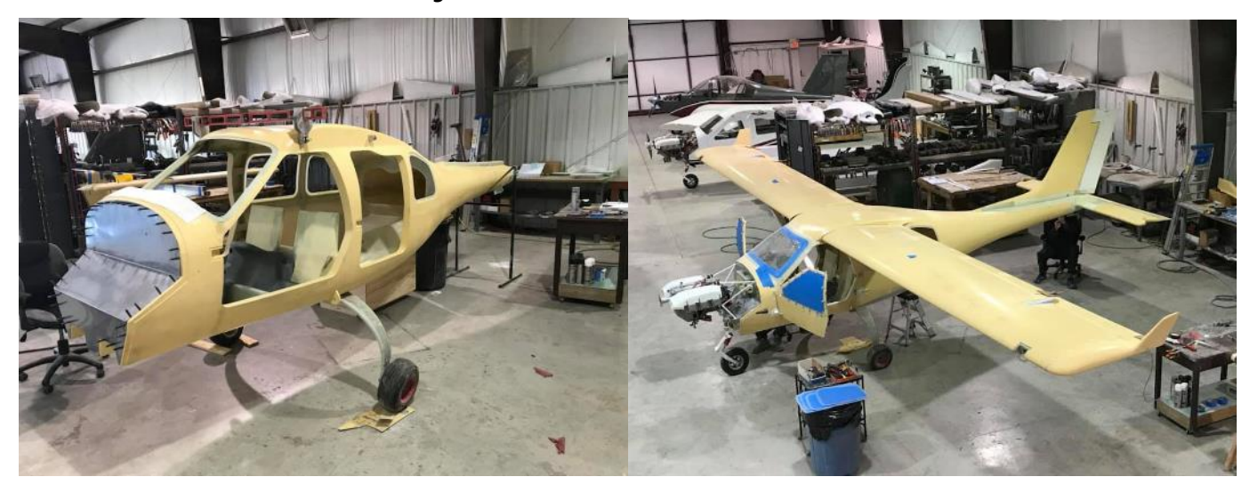
When You Know What You are Doing, Things Go Fast

Never saw any of the paint pictures, but I am sure this Jabiru aircraft is all painted nice.