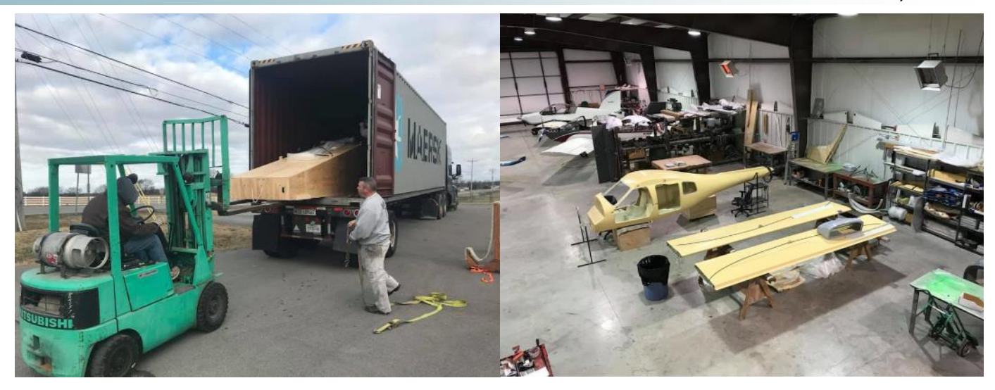
A 10 Day Crate to Paint for a New Jabiru