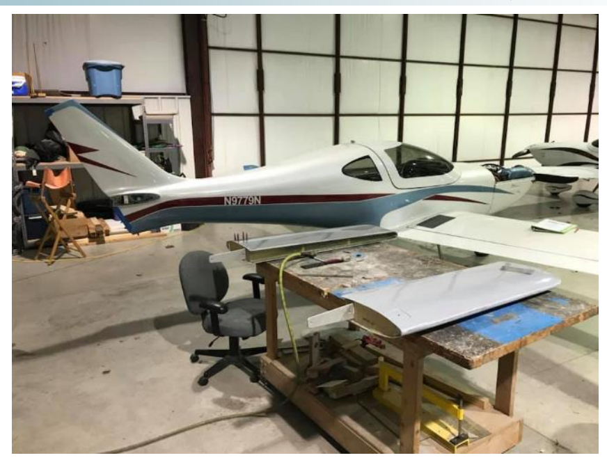
An Older Lightning Getting a Mark 2 Tail