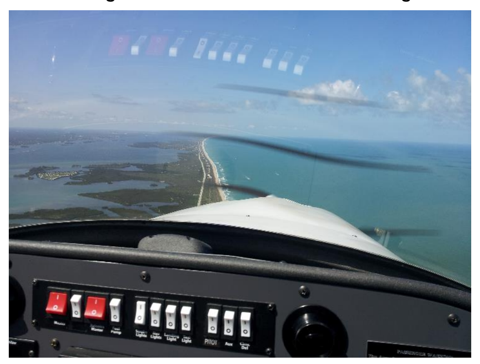
The Florida Coast Line