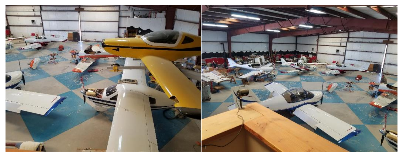
Some Pictures of the Shop