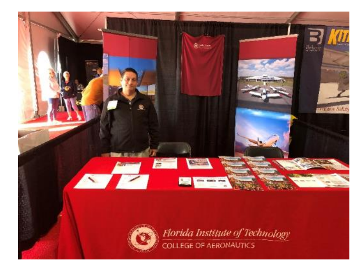
The Florida Institute of Technology Booth