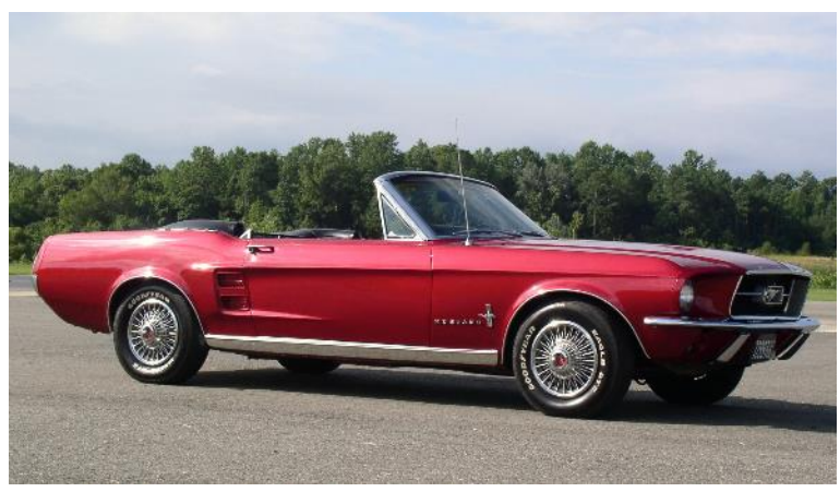
My 1967 Mustang Convertible

The picture above was taken at the Williamsburg – Jamestown airport (KJGG) several years ago. I have had it off the road for a couple of years because I began replacing the fuel tank and changing some gaskets. I am still only partially done. I need to get back on the job and finish it up. This past week would have been a great time to go cruising with the top down.