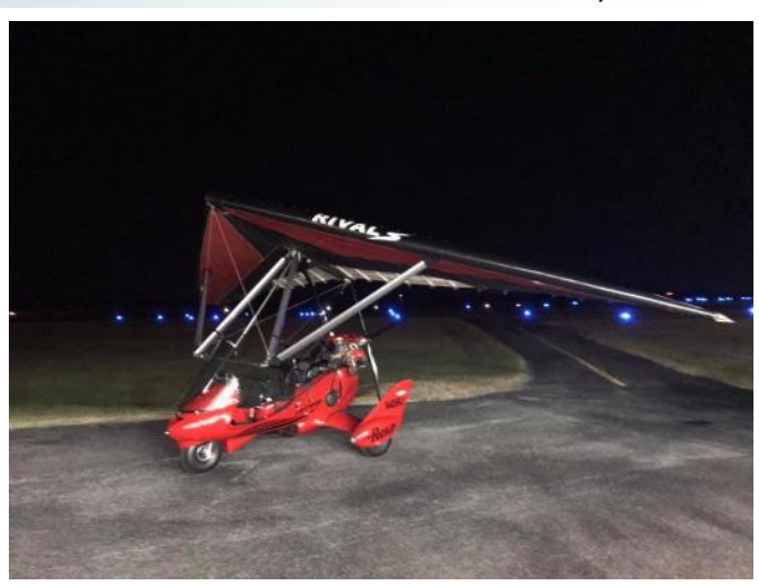
The Trike That Flew In