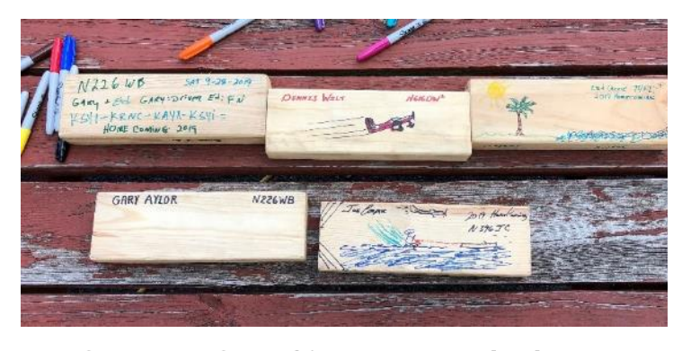
Our Very Own Giant Jenga Blocks