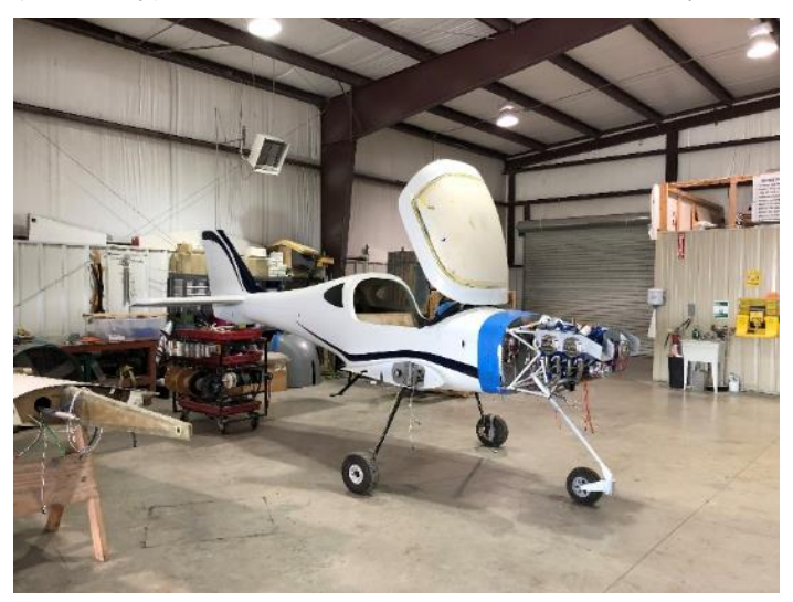
Another XS in the Works

I assume that the next Lightning Homecoming will be the last weekend in September again, which would be on September 25 (Friday) and the 26<sup>th</sup> (Saturday). I intend to be there even if I can't fly.