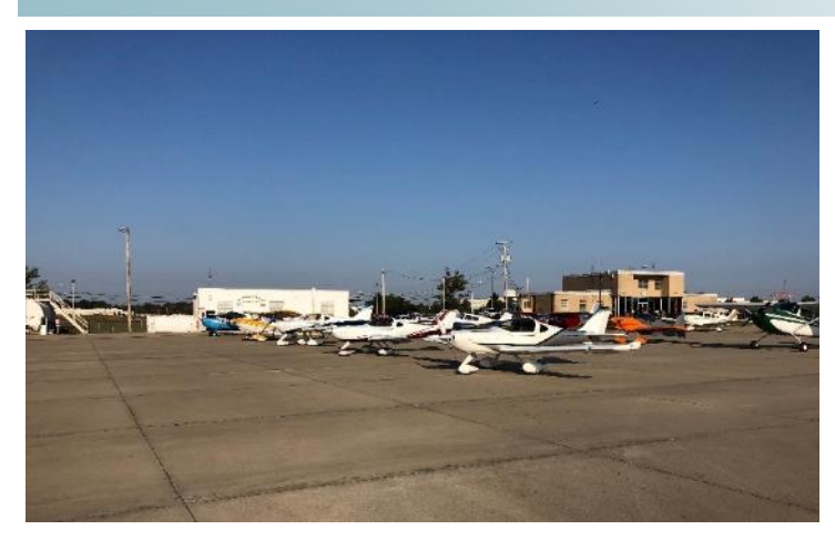
Pancake Breakfast Fly in at Shelbyville