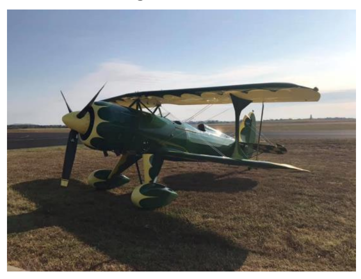
Another Beautiful Plane at the Fly In