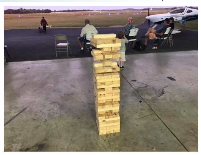
Giant Jenga Game