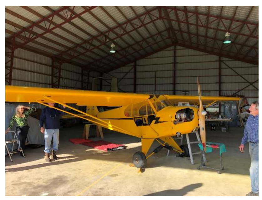
Wing Back on a Restored Cub