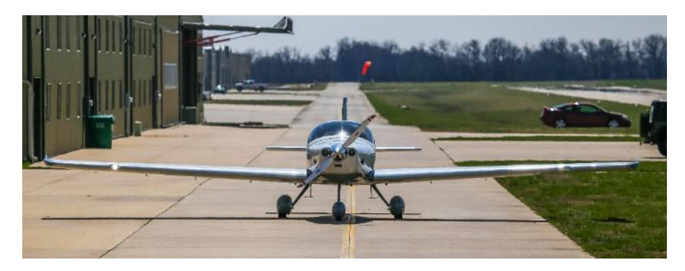
All Done - A Front View

A little bit about myself. I'm retired US Air Force where I worked primarily with a variety of missile weapon systems. After retirement, I worked a number of exciting and challenging years at Garmin Aviation (hence my flight deck). I started out in Reliability Testing and was later given the unique opportunity to join the Aviation Mechanical Engineering Design Team where I was involved mainly with experimental systems for the airplane kit builder. I had direct participation with the design of the autopilot controller, magnetometer (GMU11), and some testing on the backup systems and servos. It was a fantastic experience and I enjoyed every moment of the adventure. But a unique opportunity took me away to join Honeywell's Federal Manufacturing and Technology Center and their Environmental Engineering Testing Team. Luckily, my wife and Lightning investor (insert laugh here) works with Garmin headquarters and I keep in constant contact with all my Team X and pilot network buddies out there. I have my Fixed Wing with an Instrument rating and am about half done with my Commercial rating. I fly about 60 hours a year and am hoping to get that number up closer to the 100 mark real soon.