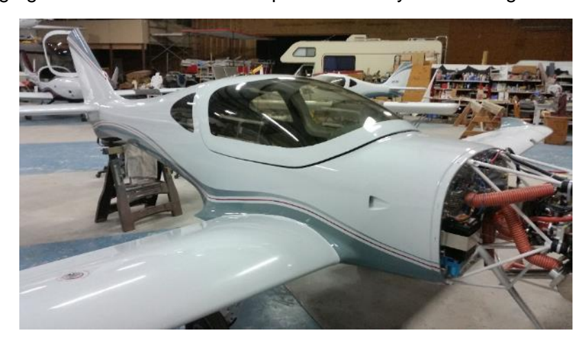
Working on the Build at Lightning West

smoothly. My plane is also IFR equipped and has a GTN650 navigator to show me the way with an additional comm for the just in case situations. The interior is typical for the Lightning with a HACman for leaning out in cruise and my bragging rights to a built-in console cup holder for my wife's in-flight water beverage service.