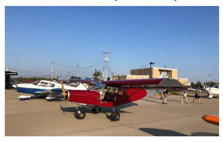
This Zenith 701 was Written up in Sport Aviation Magazine and Kit Planes