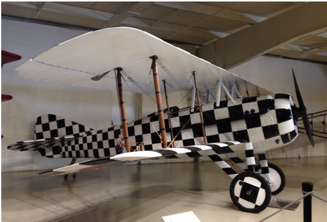
1917 SPAD XIII.C.I

The following picture is of Donna's favorite airplane in the exhibit. She really liked the paint scheme. It is an exact replica of the paint scheme on the aircraft flown in WWI. Just beautiful.