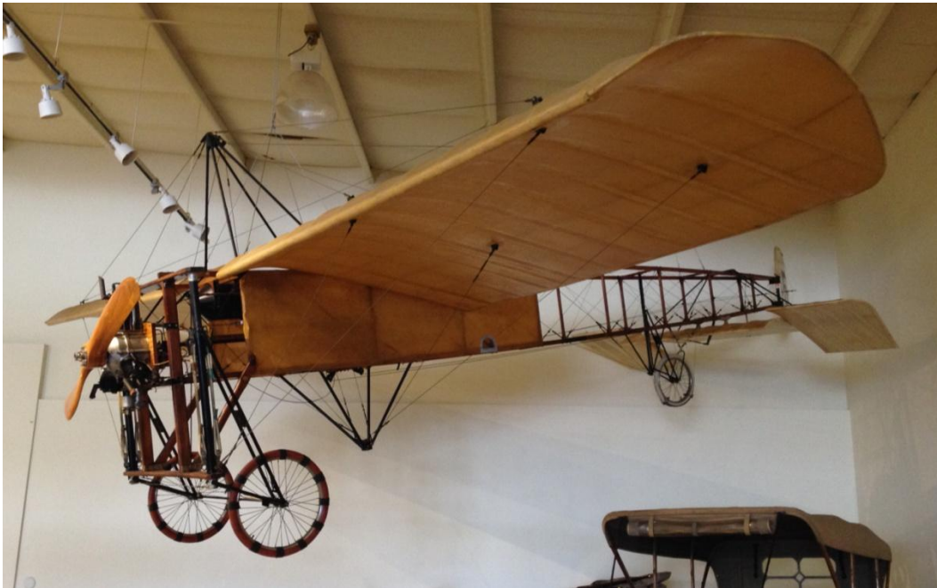
How about a Bleriot?

This replica was built and flown for a 1958 movie, The Lafayette Escadrille . The aircraft was fitted by an authentic 3 cylinder Anzani Engine by the museum.