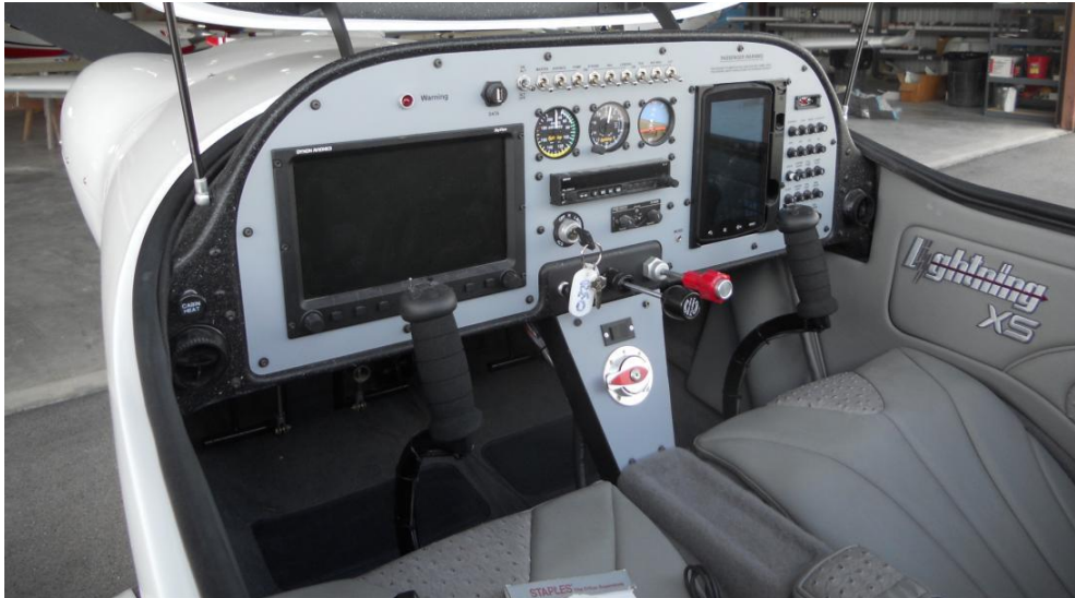
N320XS cockpit with a Dynon SkyView.

The June flights in N320XS were on very hot and humid days. At the Shelbyville Airport, with an elevation of 801 feet, the surface temperature for the all flights was between 89 and 93 degrees F. The surface density altitude (DA) varied between 2600 to 2900 feet. Definitely not a standard atmospheric day, but the XS performed amazingly.