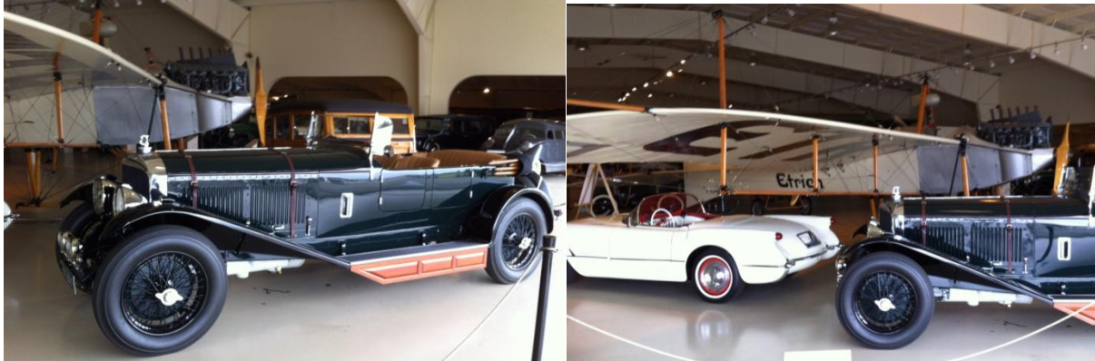
A Bentley with a 1913 Etrich Traub behind it and an old Corvette Have you ever heard of an Etrich Traub?