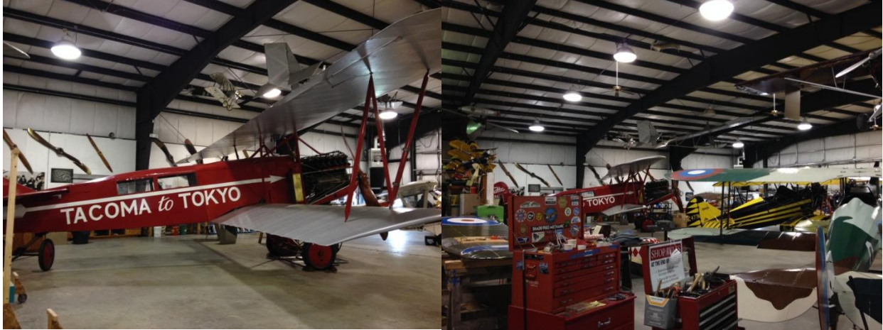
A 1923 Fokker C.IV. and the Hangar