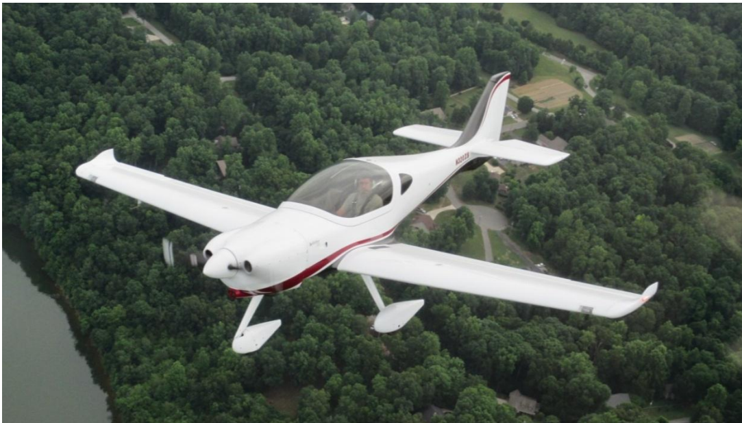
N320 XS, the 160 HP Lycoming O-320 powered Lightning.

I recently had another chance to fly Arion’s latest development aircraft, Lightning N320XS. I had first flown this new higher powered (more cubic inches and more horse power) Lightning in late March 2014, just before Sun-N-Fun. However, the overall design and set-up at that time was still being finalized and it needed some changes before it was ready for a flight report test flight. For example, the engine was not developing full power due to fuel distribution issues which caused it to run rough at higher RPM speeds. Also, the main landing gear legs were configured so that the main wheels were too far aft which required touchdown speeds to be too high. There was no nose gear leg fairing or wheel pant installed. And finally, the propeller (a newly developed Sensenich ground adjustable carbon fiber prop) was pitched too low for the 160 HP engine on a low drag airplane like the Lightning. All of those issues have now been corrected, so in mid-June, I flew back to Shelbyville, Tennessee, the home of Arion Aircraft, to once again fly N320XS.