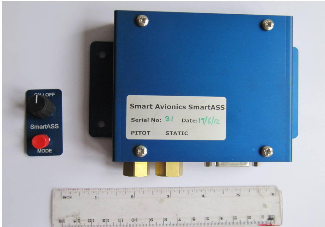
Fig 3. The control panel and box. A prewired connecting system is included in the kit.

gives you your speed at intervals. At cruising speeds touching the button will put her into sleep mode.