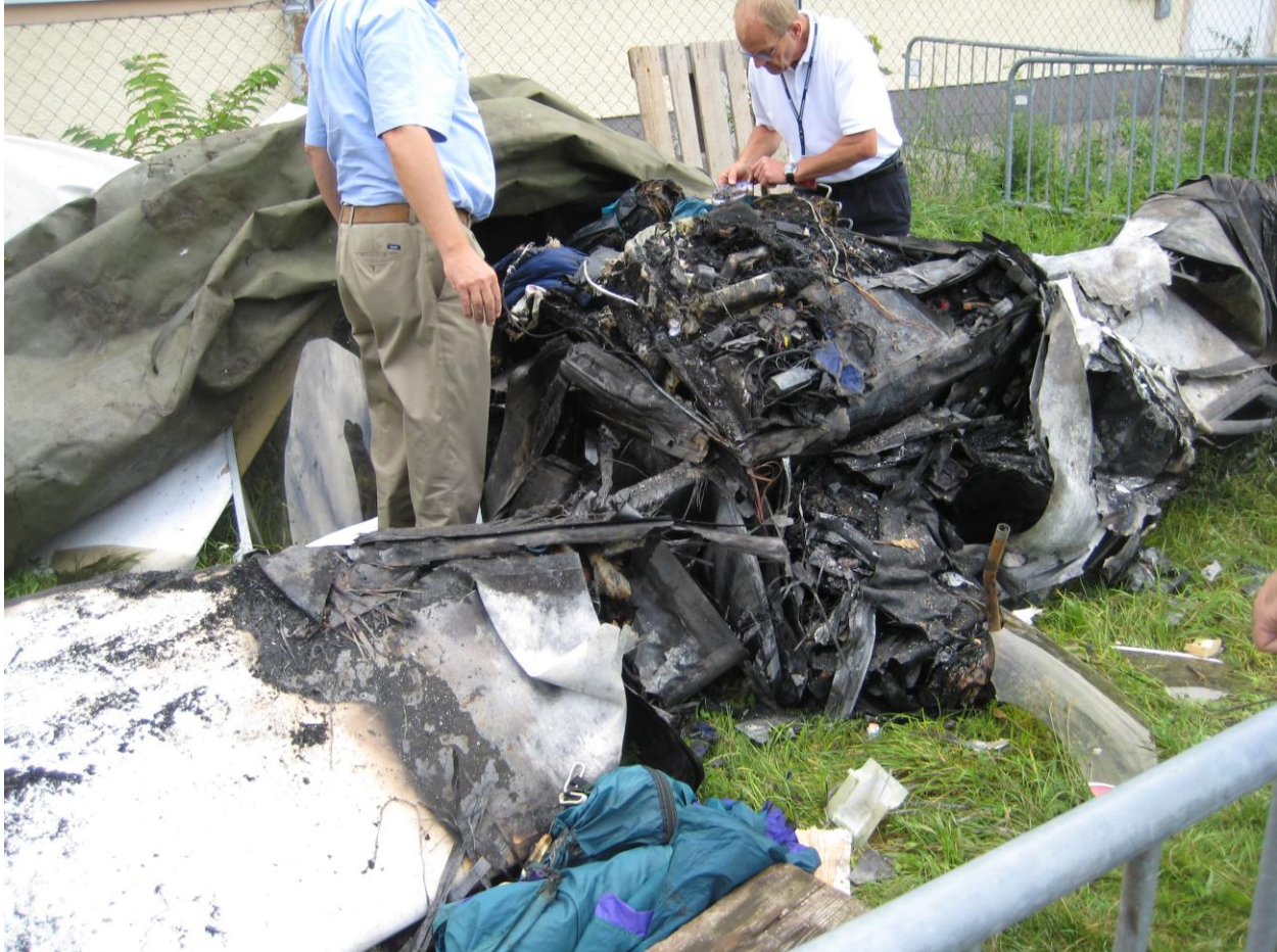
Fig 1 A burnt out Europa

apparently turning back at about 200ft. Then last year a highly experienced Australian pilot had a similar occurrence shortly after take off. So seven deaths in the Europa family in 6 years.