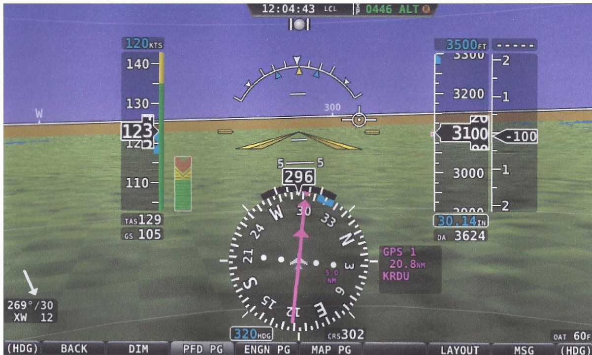
Fig.3 The latest Dynon Skyview EFIS with AOA display. In earlier versions the AOA was a bit more prominent