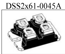
MOUNT DIODES WITH HEAT CONDUCTIVE GREASE